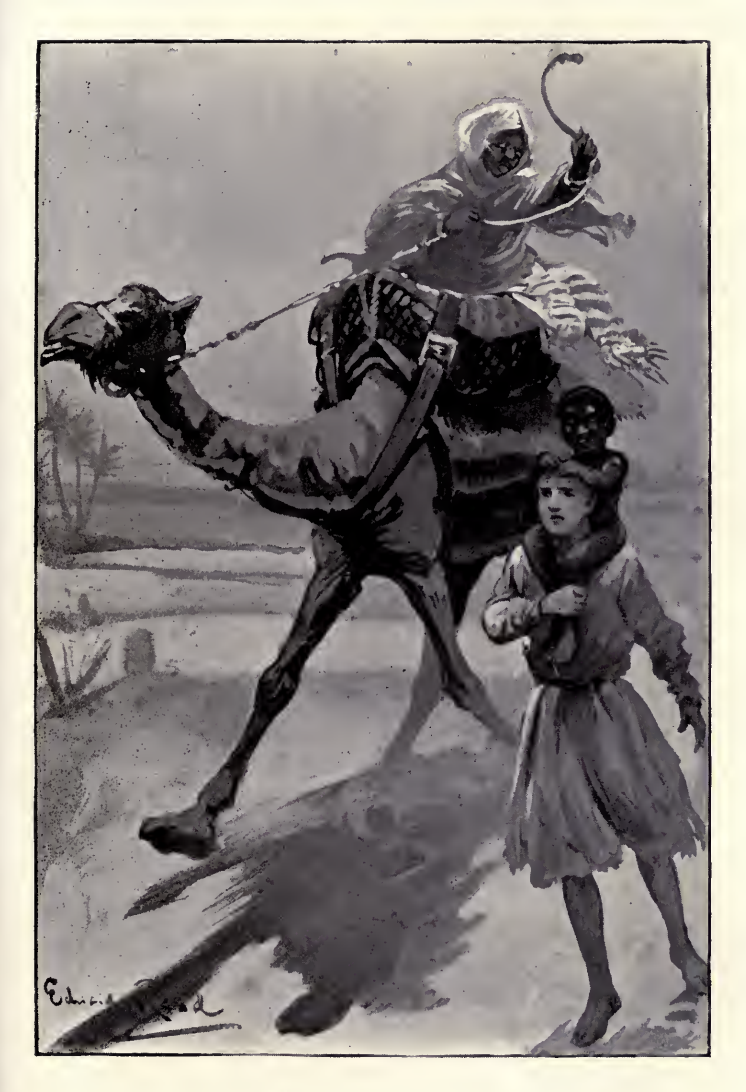
URGING HIM FORWARD WITH LOUD SCREAMS AND BLOWS.